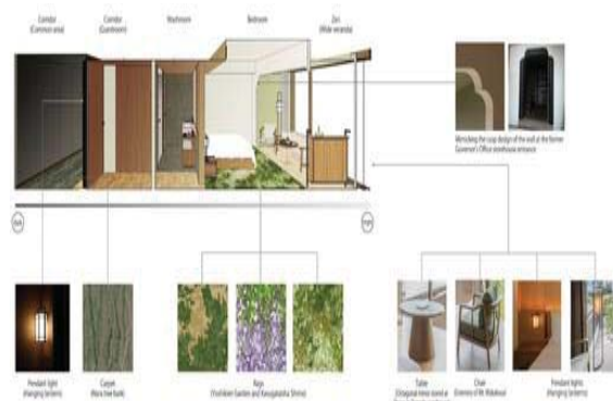
Figure 3: Reference image