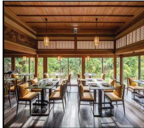
Figure 2: Reference image

These old buildings have been strengthened against earthquakes and renovated both inside and out to be preserved and used while also improving their appeal. The buildings have been improved by introducing an accommodations building featuring a peaceful tiled roof and walls with sturdy columns, common in Nara-style architecture, and a spa building that combines Japanese and Western design elements similar to the old Youth Hall building. A distinctive hotel has been established for guests to stay and learn about the history, culture, and natural beauty of Nara through a combination of tradition and modernity design concept.