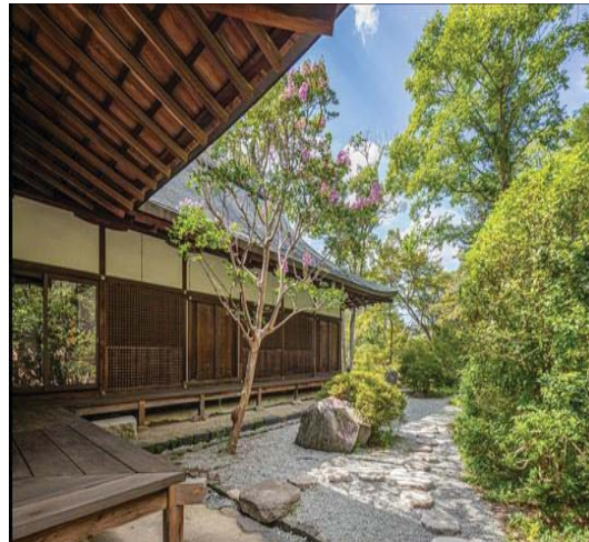
Figure 1: Reference image