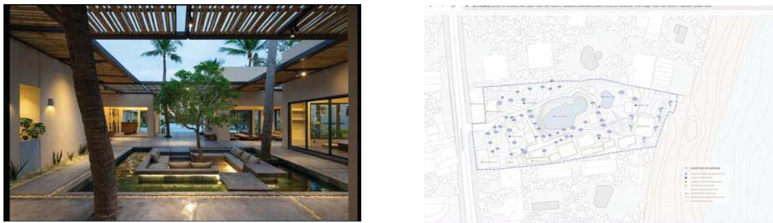
Figure 5: Reference image

The goal of the project is to integrate seamlessly with the surrounding natural environment by strategically controlling soil removal and addition, while also protecting most of the existing coconut trees. Materials commonly utilized in construction are those that can be readily recycled, such as stone, wood, steel, and adobe bricks. To decrease new resource extraction, we reutilized stones and wood from existing structures.