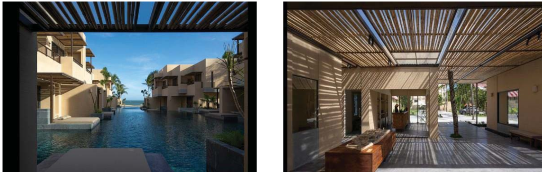
Figure 4: Reference image

The goal of the project is to integrate seamlessly with the surrounding natural environment by strategically controlling soil removal and addition, while also protecting most of the existing coconut trees. Materials commonly utilized in construction are those that can be readily recycled, such as stone, wood, steel, and adobe bricks. To decrease new resource extraction, we reutilized stones and wood from existing structures.