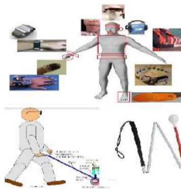
Figure 1: Modern Aids for visually challenged

decided to develop a smart stick that would make their life a lot easier. Various sensors collect data from the environment, which the controller then processes. Images, ultrasonic sensors, infrared sensors and motion sensors are all included in this set of sensors. RFID has been proven to be a useful tool for tracing the path of tagged things. When using the tagging approach to identify items, this is the method of choice. An audio feedback is also used to help visually impaired people find their way around. An accurate real-time location can be determined by using GPS, a satellite-based radio navigation system. A concerned person receives this location information in the event of an emergency. The same can be said for a GSM module. It's possible to communicate with the device through other modules such as Bluetooth, Wi-Fi, and the like. Microcontrollers are the most common type of processor utilised in these devices. The PIC18F2520, MC68HC11E2, PIC16F887, and LPC2148 are just a few examples of microcontrollers of this type.